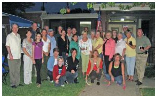
September meeting attendees outside the new HCAC building.